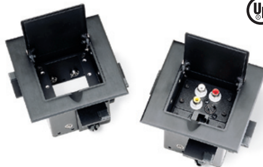
Shown with optional MAAPs